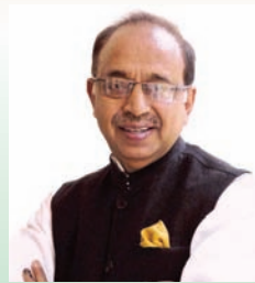
Shri Vijay Goel Minister of State for Statistics & PI