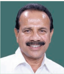
Shri D.V. Sadananda Gowda Minister for Statistics & PI

We hope that this would be useful to the Members of Parliament and other users.